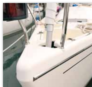
Below the deck fitting