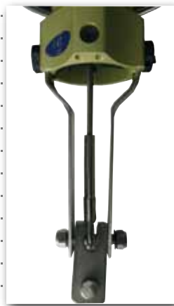
Long link plates fitting.