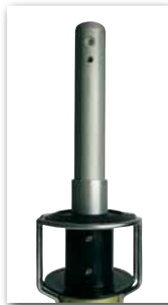
Fitting with turnbuckle cylinder