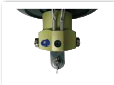
Closed to the deck fitting.