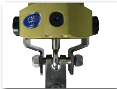
Standard fitting with short link plates