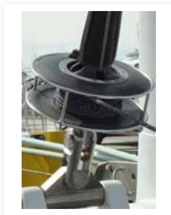
NEX STR 20 stayfurler on 80' catamaran - Magic Cat Fitting Atelier Grément