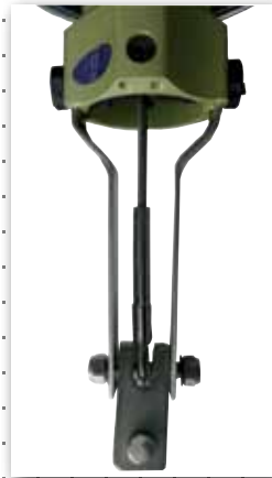
Long link plates fitting