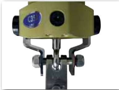
Standard fitting with short link plates