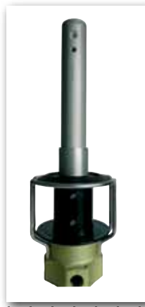
Fitting with turnbuckle cylinder