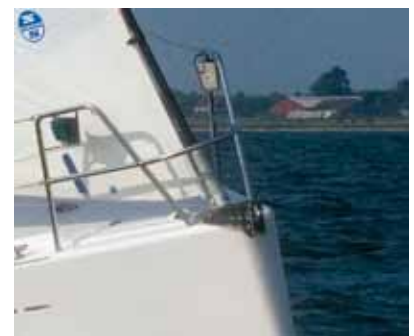
Below the deck fitting