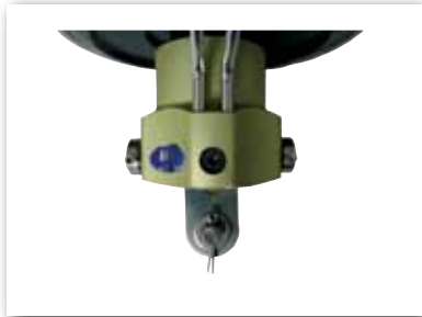
Close to the deck fitting with stainless steel lockers